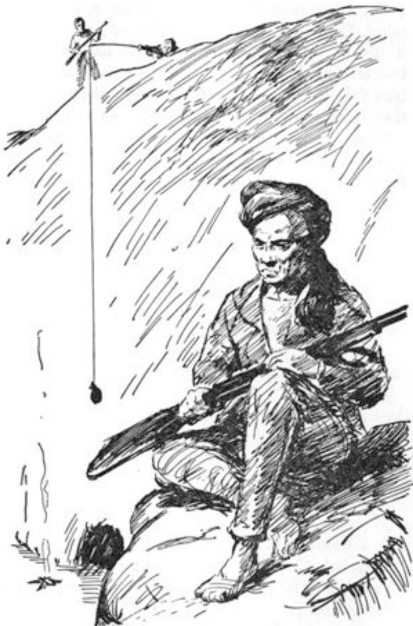
A sudden jerk would attract the guard's attention

The bag went down an inch at a time, while he concentrated on keeping the motion slow but steady. A sudden jerk might attract the guard's attention, but very slow motion probably wouldn't.