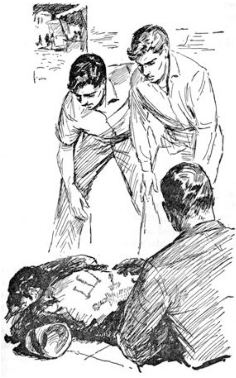
The man's back was tattooed with a strange design

man slumped to the ground, the red fez dropping into the dust.